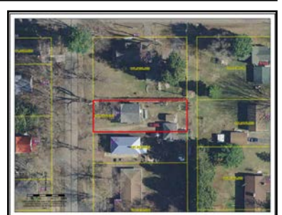
For Details & Showings, Contact-