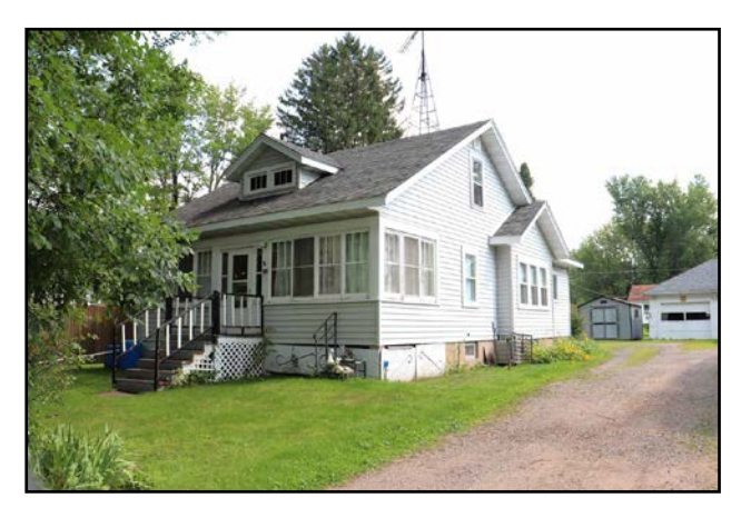
812 School Street Withee, WI 54498